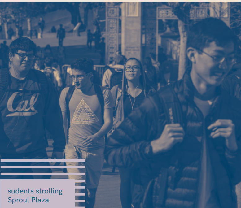
students strolling Sproul Plaza

To these ends, a Graduate Student Project Lead, funded as a full-time GSR, will be hired to focus on developing and implementing the summer research program and other departmental climate initiatives. Graduate Student Project Leads will conduct research on best practices, recruit students, help design the summer research program, and coordinate all aspects of the DEI Pilot Program. Additionally, one Graduate Student Program Assistant will be hired to supplement the work of the Graduate Student Project Lead.